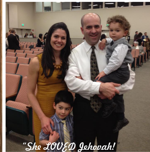
"She LOVED Jehovah!"