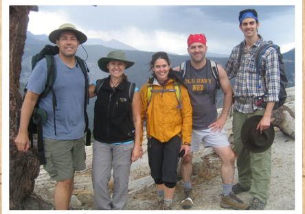
"Lived every moment to the full"