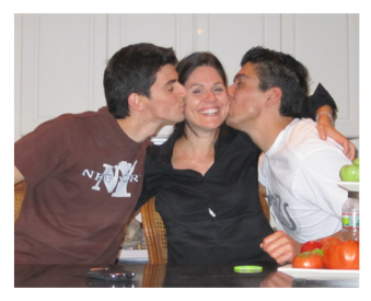
"Warm & Loving"