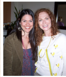
"A beautiful soul"