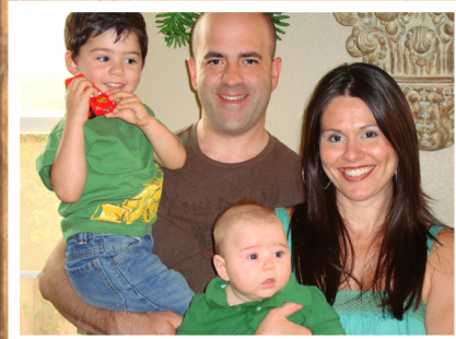
"Devoted Wife & Mother"