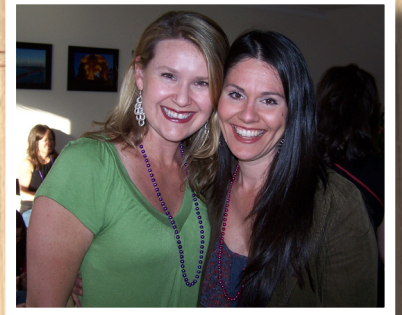
"A big beautiful smile and even bigger dimples"